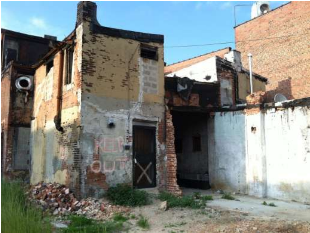
Rear facades 1211 and 1209 West Baltimore Street