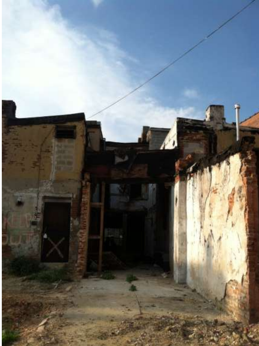
Rear façade 1209 West Baltimore Street