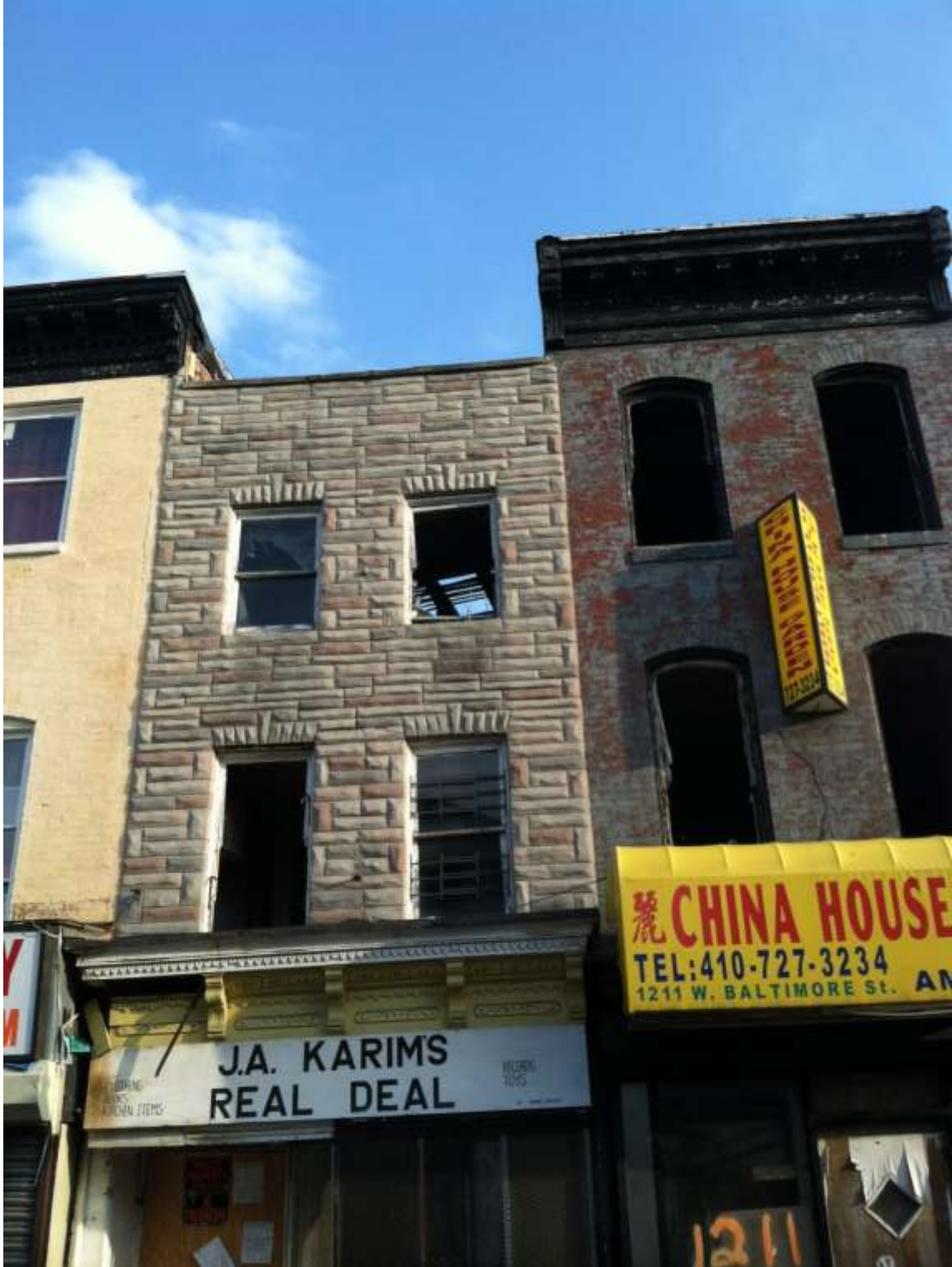
1209 and 1211 West Baltimore Street