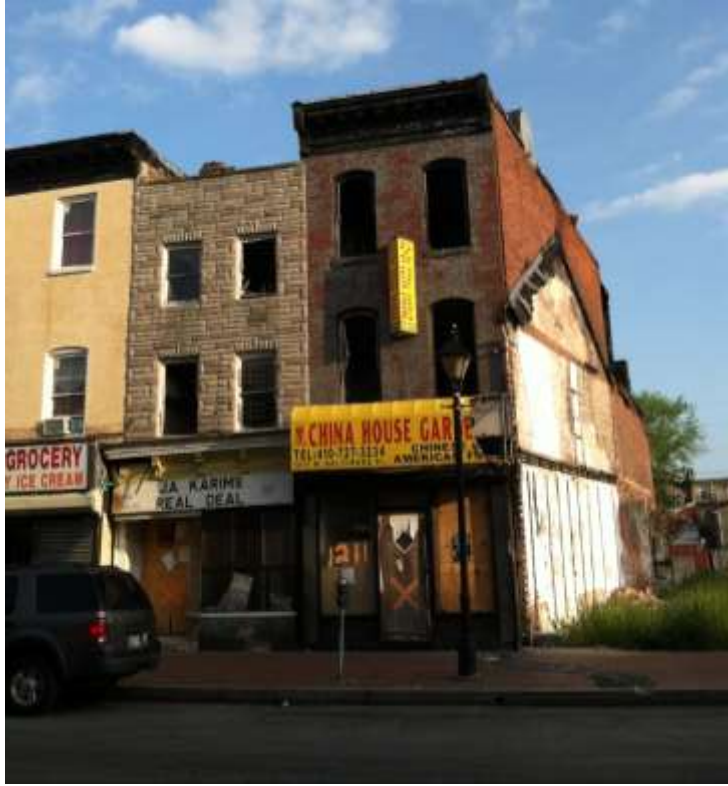
1209 and 1211 West Baltimore Street