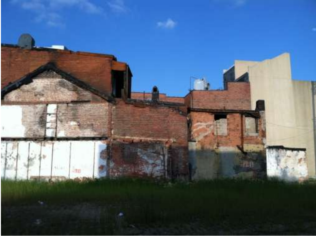
Side façade (west) for 1211 West Baltimore Street