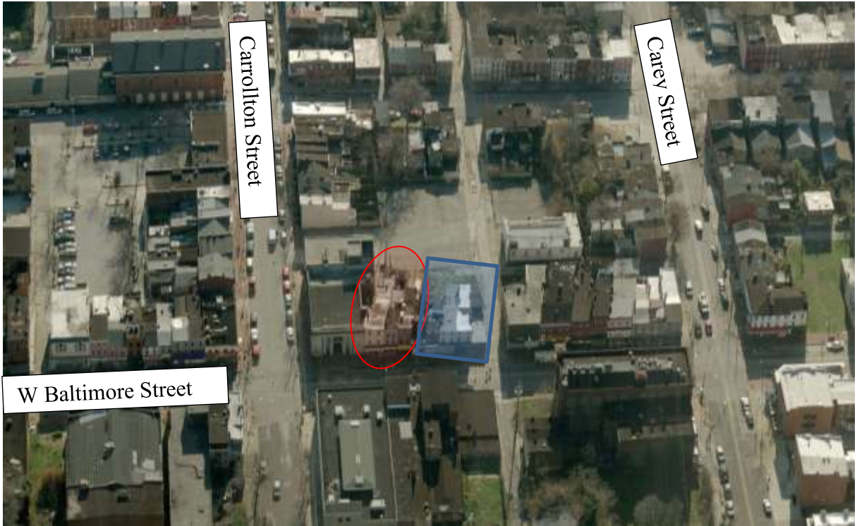
In 2012, 1213 through 1221 (marked in blue) were razed by the Department of Housing and Community Development. There were life-safety issues.